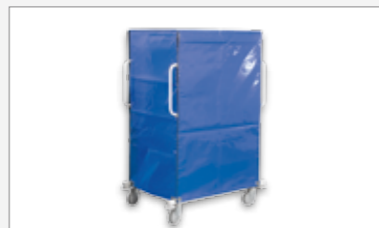
1464787 Cover in nylon (for R-20 1464882)