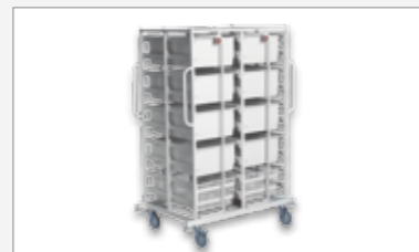
1464797 Lockable bar prevents unauthorized removal of trays and modules. Stops can optionally be mounted on the back (1464800)