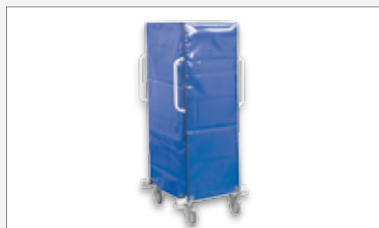
1464786 Cover in nylon (for R-10 1464881)